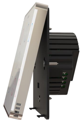
Figure 3: Install Touch Panel Unit

Note: Zero-Cross technology is unavailable if the device operates using DC voltage (24-48VDC).